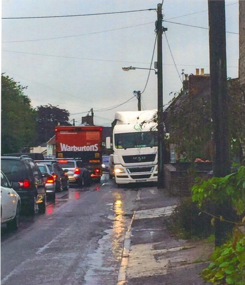
The regular street scene outside Chapmanslade School when an overweight HGV takes a short cut on the A3098 as photographed by a parent taking a child to school